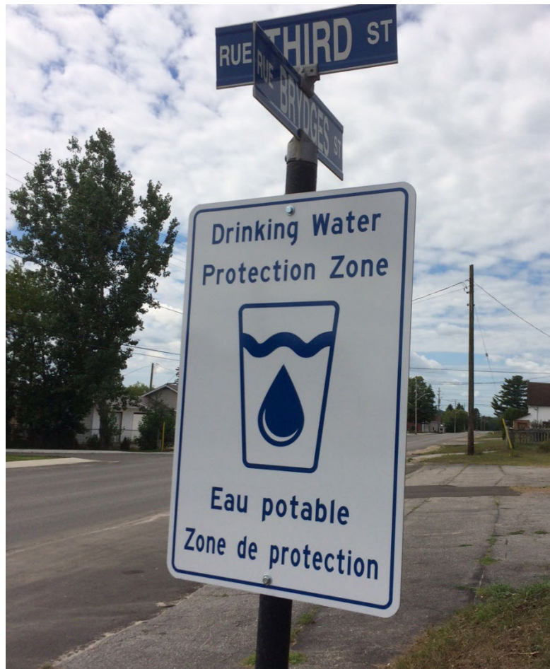
Figure 2: Municipal road signs marking intake protection zone and wellhead protection areas