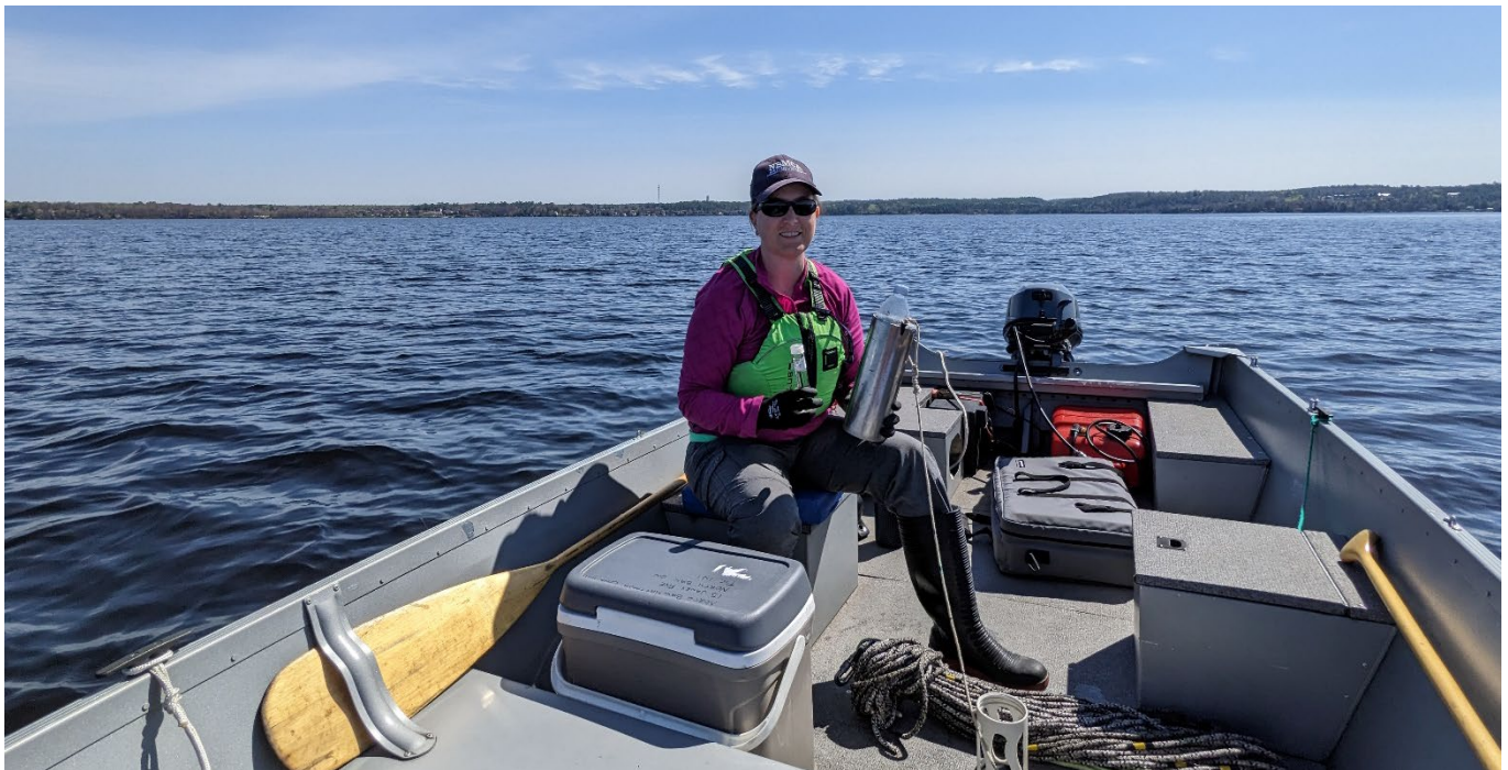
Figure 1: NBMCA staff collecting water samples on Callander Bay for total phosphorus analysis

The North Bay-Mattawa Source Protection Committee wishes to express their thanks to municipalities for the long-standing cooperation in Source Protection Plan implementation.