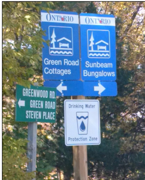
Above: Municipalities have installed roadsigns stating 'Drinking Water Protection Zone' to mark the location of intake protection zones and wellhead protection areas.

To learn more about the North Bay-Mattawa Source Protection Area, visit actforcleanwater.ca .