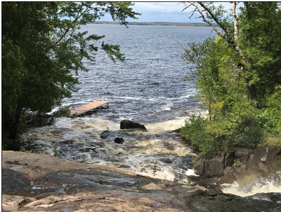
Above: The Wasi River empties into Callander Bay after a dramatic set of waterfalls.

The North Bay-Mattawa Source Protection Committee wishes to express its thanks to municipalities for the long-standing cooperation in Source Protection Plan implementation.